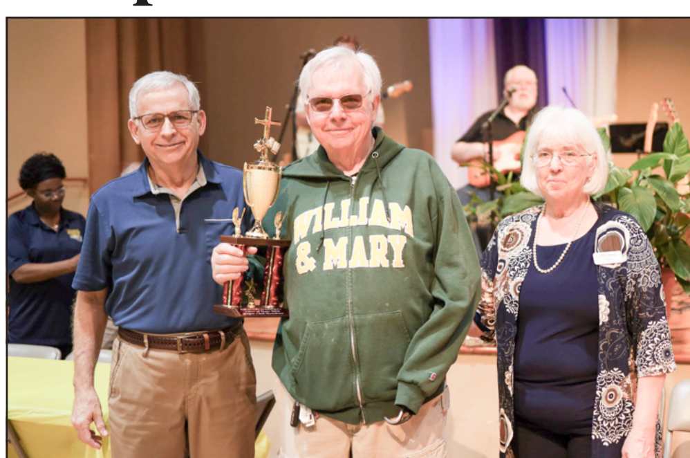
The Coosa Methodist Men's Bible Study won the Grand Champion prize with their Mama's Chicken Noodle Soup by raising the most money through ticket sales and donations.