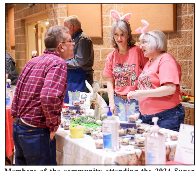
Members of the community attending the 2024 Super Chef Showdown stopped at each of 16 tables to sample the participating chefs' creations March 9.

'It really is a blessing that we can do something like this and give up our time to help give back to others who are less fortunate," a representative from the group said.