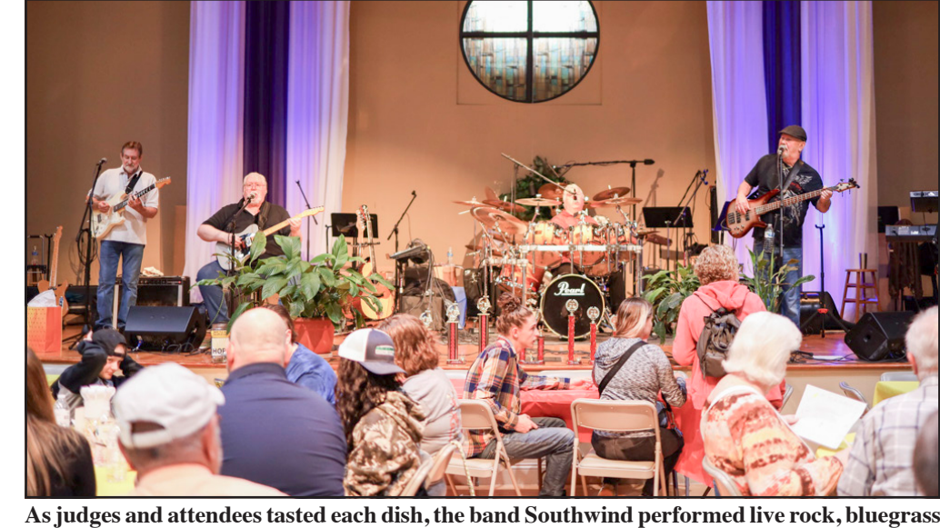
and folk music at the Super Chef Showdown Saturday.